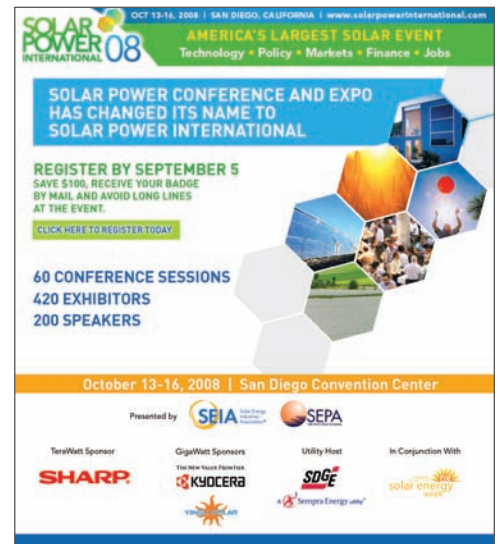
Web media: HTML email blast