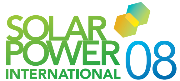
New logo design