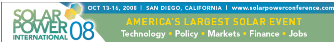
Web media: Dynamic banner ad